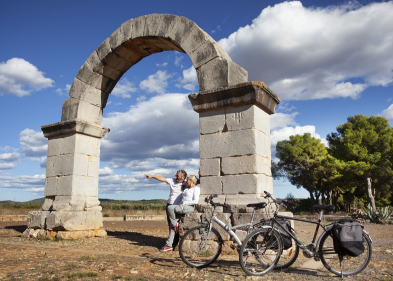
ROMAN ARCH OF CABANES