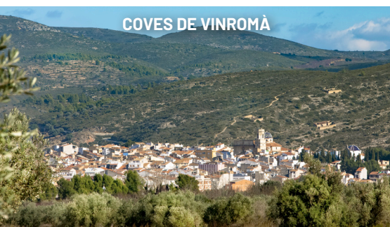
COVES DE VINROMÀ

VIA AUGUSTA CONNECTS EACH OF THESE VILLAGES THAT ARE PROUD OF THEIR RURAL TRADITION. It is impossible not to want to get lost in each one of them!